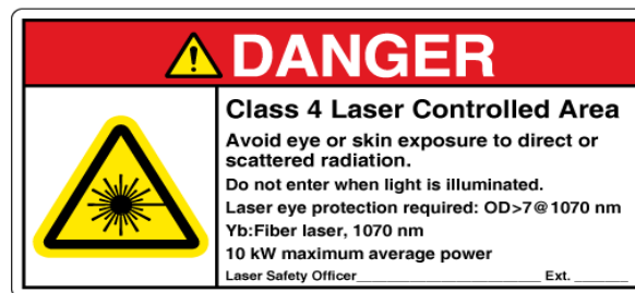
Figure 1c. Sample ANSI Z535.2 Compliant Class 4 Laser Controlled Area Danger Sign Format.